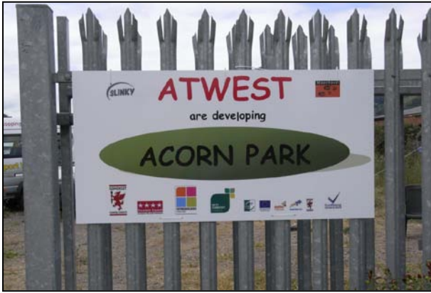
The sign on our new gates.