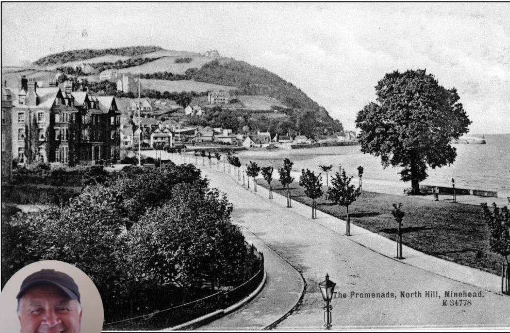
The Promenade, North Hill, Minehead. E 34778

This photo was taken some time in the 1890s. There's not too much in the way of sea defences, and only a few houses on North Hill. Standouts are Mount Royal, Beaconwood and Elgin Tower. The one on the very top was empty for most of the sixties - used by hippies.