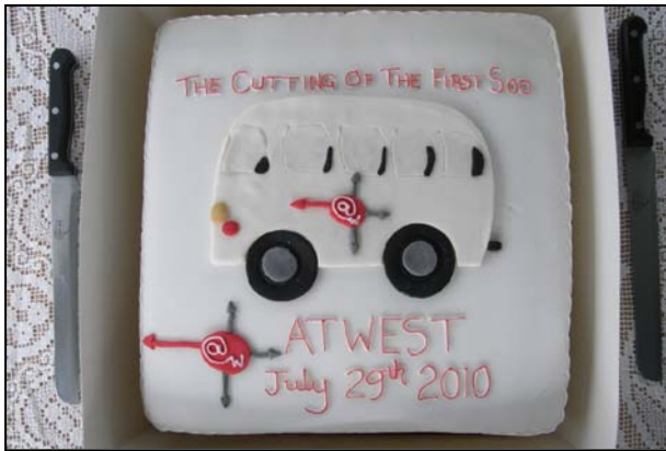
The cake that launched the development!