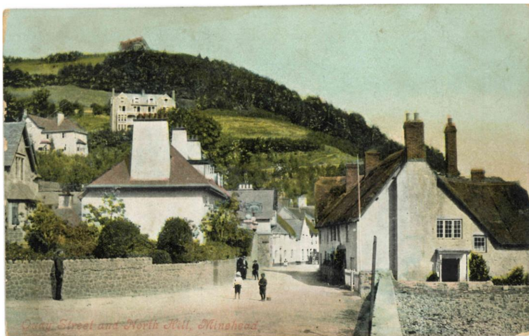
Quay Street, Minehead circa 1900

Mount Royal, which was a private residence, stands out behind the Red Lion. It still looks the same today.