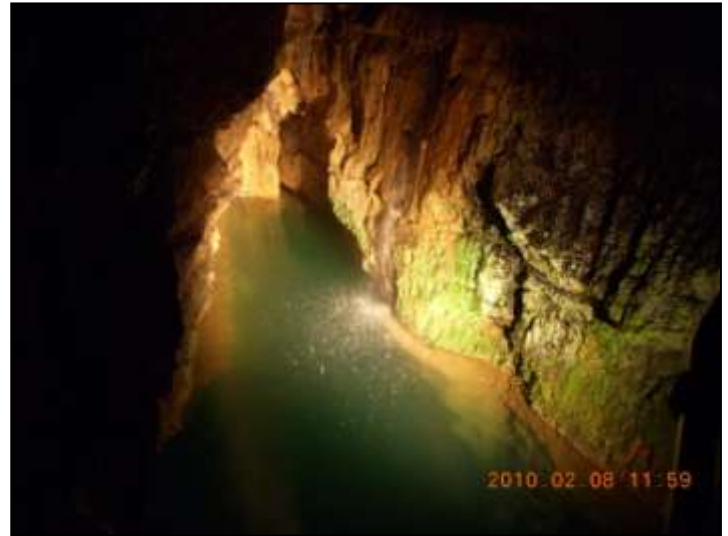
Some of the caverns at Wookey Hole

On February 8 th Minehead and District U3A Geology group used AtWest for the first time, to take them to Wookey Hole and Cheddar. The aim was to try and see the caves at Wookey, and Cheddar Gorge and Gough's Cave, Cheddar all in one visit. It was a tight schedule but they succeeded in seeing it all, and having a very informative and enjoyable trip.