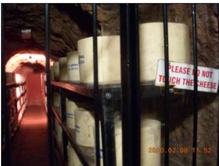
Some of the cheeses maturing in the caves at Wookey before being delivered to Sainsburys!

The final part of the trip was a self-guided audio tour of Gough's Cave at Cheddar, finishing with a cream tea! The group had a very good day and on the journey home discussed where they could visit next - the Jurassic Coast of Dorset seemed a popular choice!