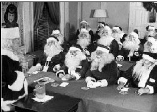
Training has already begun for Christmas 2012!