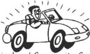
Minehead Community Cars

As many of you may know Atwest took over the running of the social car scheme from Engage in September. This uses volunteer drivers driving their own vehicles, for which they are paid a fixed rate per mile. We started with two drivers (inherited from Engage) which has grown to ten.