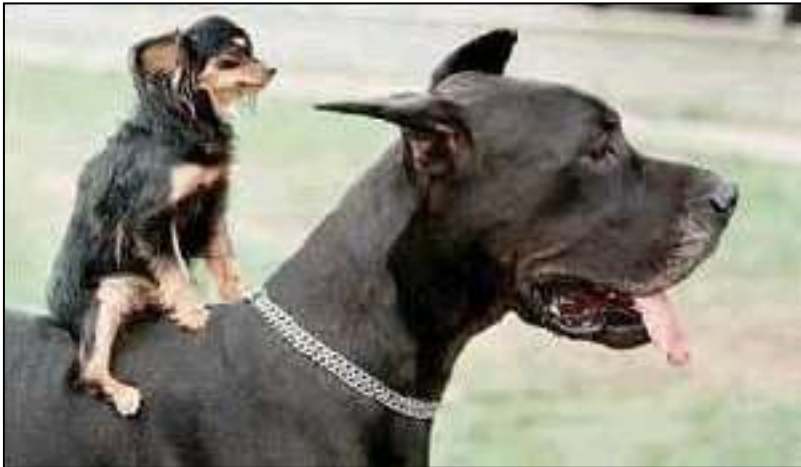
Brings a whole new meaning to dog racing!

Andrew Lloyd Webber always took his cat to work at the theatre. Being such a familiar figure the cat was often given tit bits and munchies and quickly became known as the Fat Tom of the Opera!