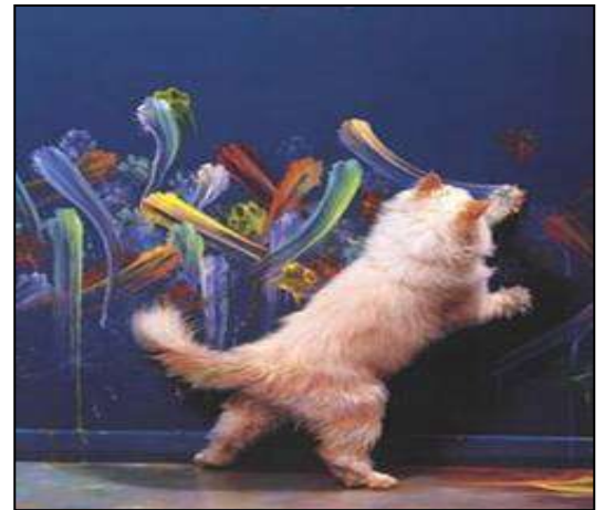
Look for the finished picture in Tate Modern!